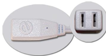
Bipolar Cable (2 Flat Prong), Sterile/Single Use BCD-FP: 10 Pieces