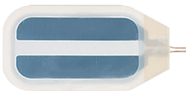
Neutral Plate Single Use IEC-NPD: 25 Pieces